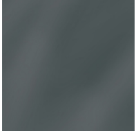
Gun Metal - 25 (GUM)